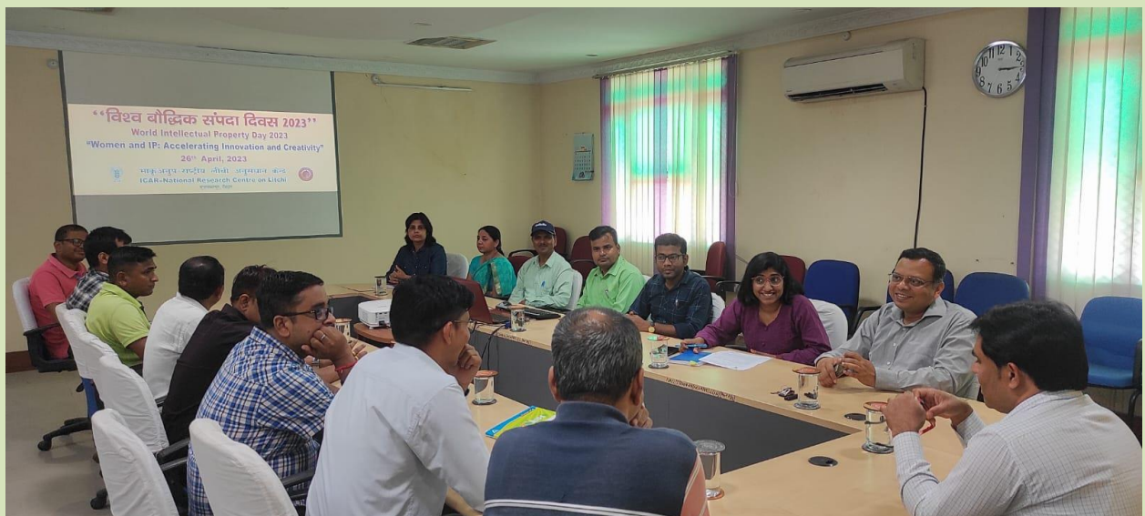
Glimpses of the World IP Day Celebration